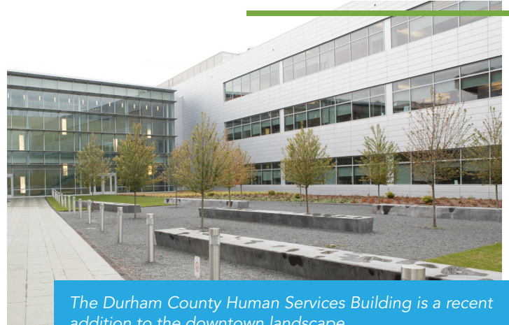
The Durham County Human Services Building is a recent addition to the downtown landscape.

We need your help to achieve Durham County's strategic goals. Have an idea? Please contact us using one of the many ways listed in this report.