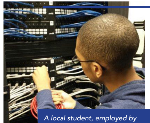
A local student, employed by the County, participates in the YouthWork Internship Program.