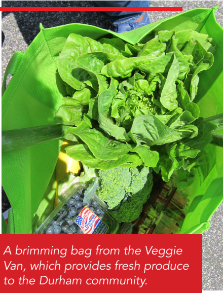
A brimming bag from the Veggie Van, which provides fresh produce to the Durham community.