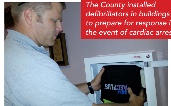
The County installed defibrillators in buildings to prepare for response in the event of cardiac arrest.